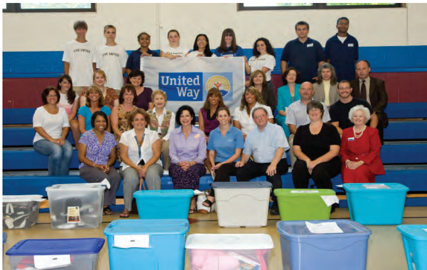
Members of the CVC drop off their bins of supplies