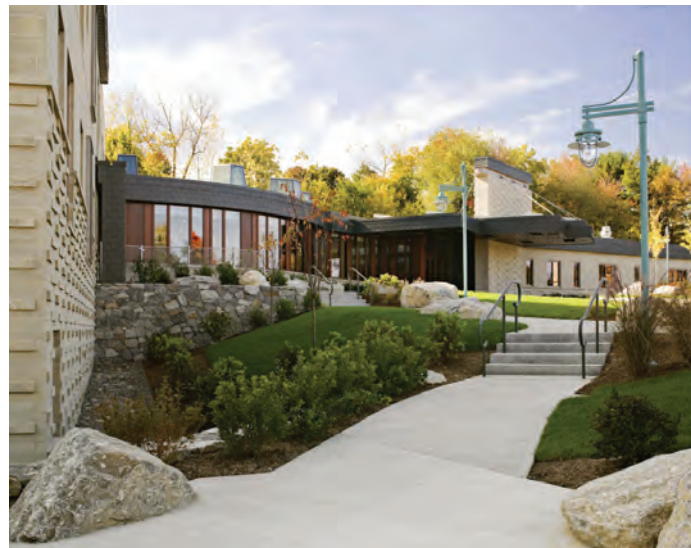
Griffin Hospital's Center for Cancer Care

Reservations can be made electronically at www.valleyunitedway.org or by returning the mailed hard-copy invitation.